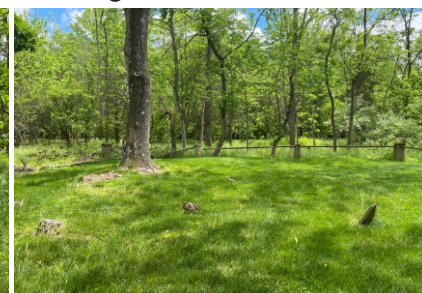
The private cemetery