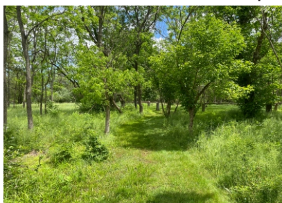
The right of way easement